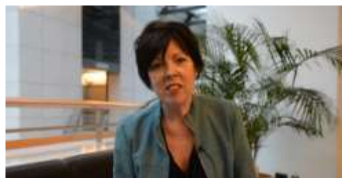
Theresa Griffin, MEP

“...we have to look at buildings not as inert objects but as actually part of the energy transition...”